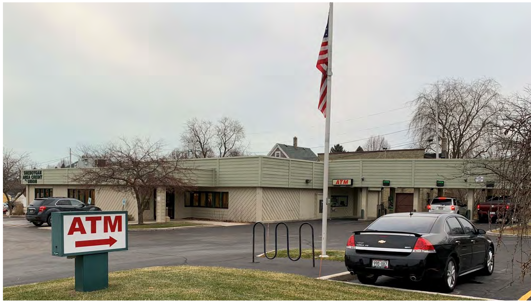
EXISTING FROM NORTH WEST