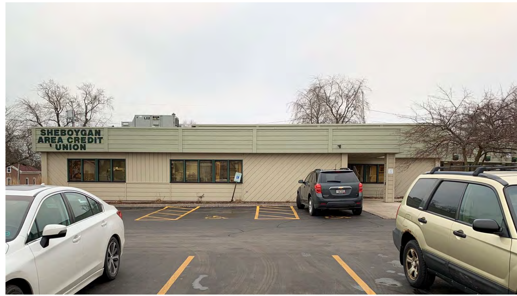
EXISTING FROM NORTH