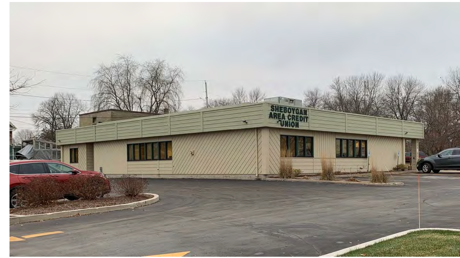
EXISTING FROM NORTH EAST