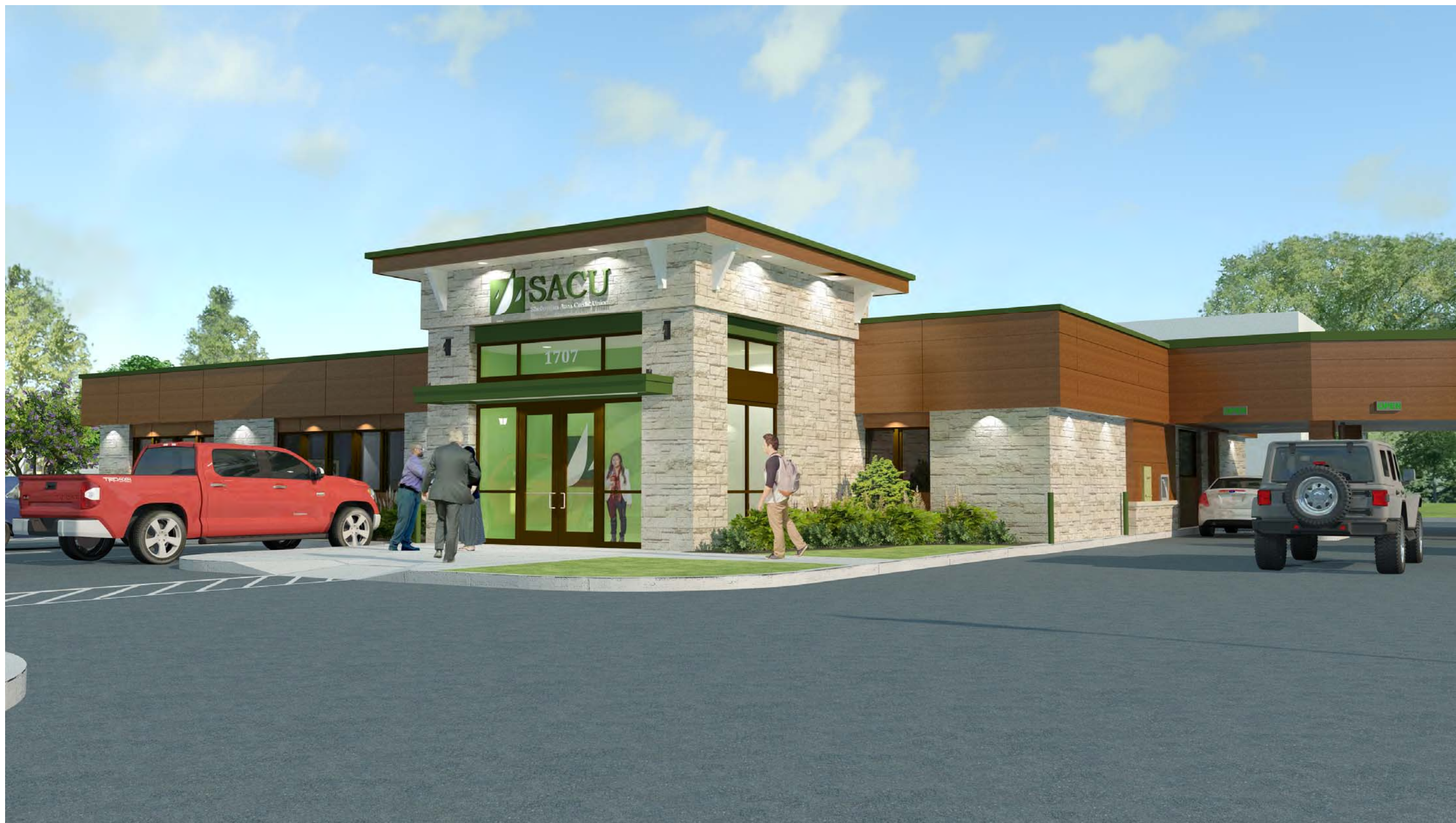
PROPOSED RENOVATION FROM NORTH WEST