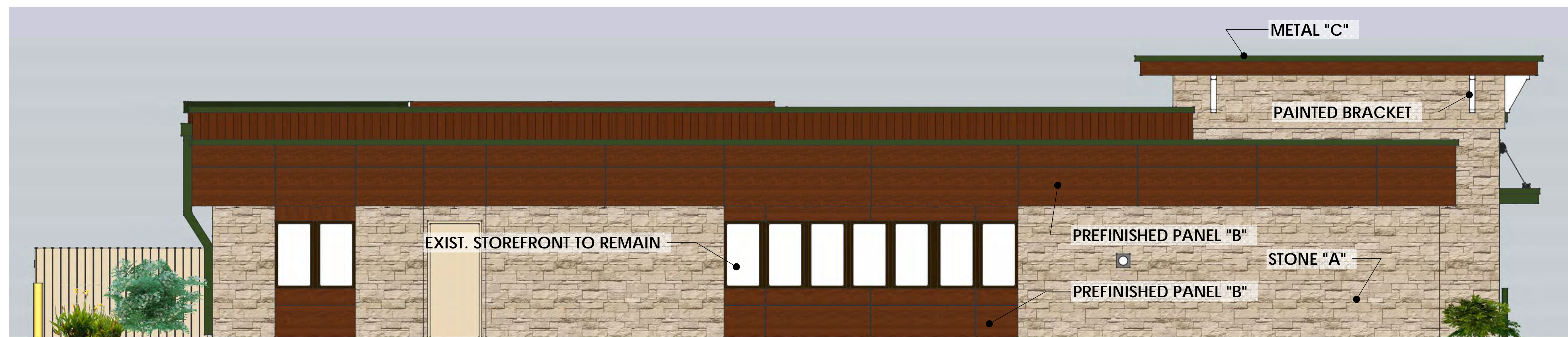
EAST ELEVATION (SOUTH 17TH STREET) SCALE: 1/4" = 1'-0"