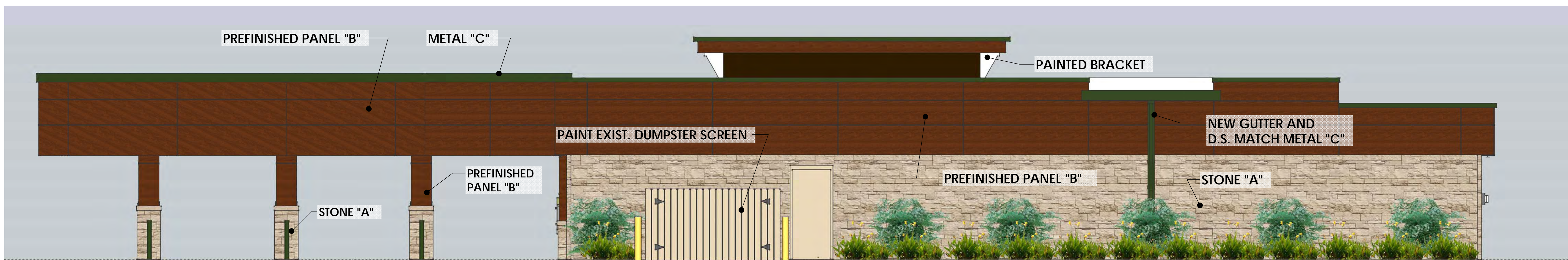
SOUTH ELEVATION (ALLEY) SCALE: 1/4" = 1'-0"