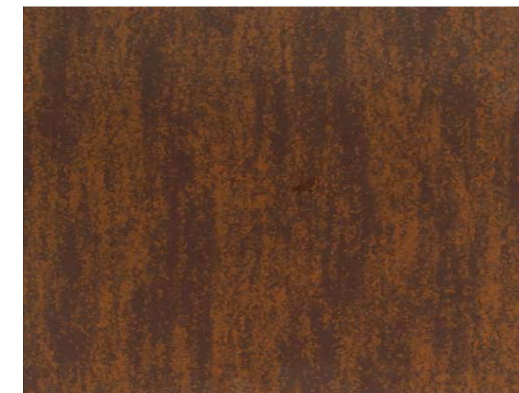
PREFINISHED PANEL "B"