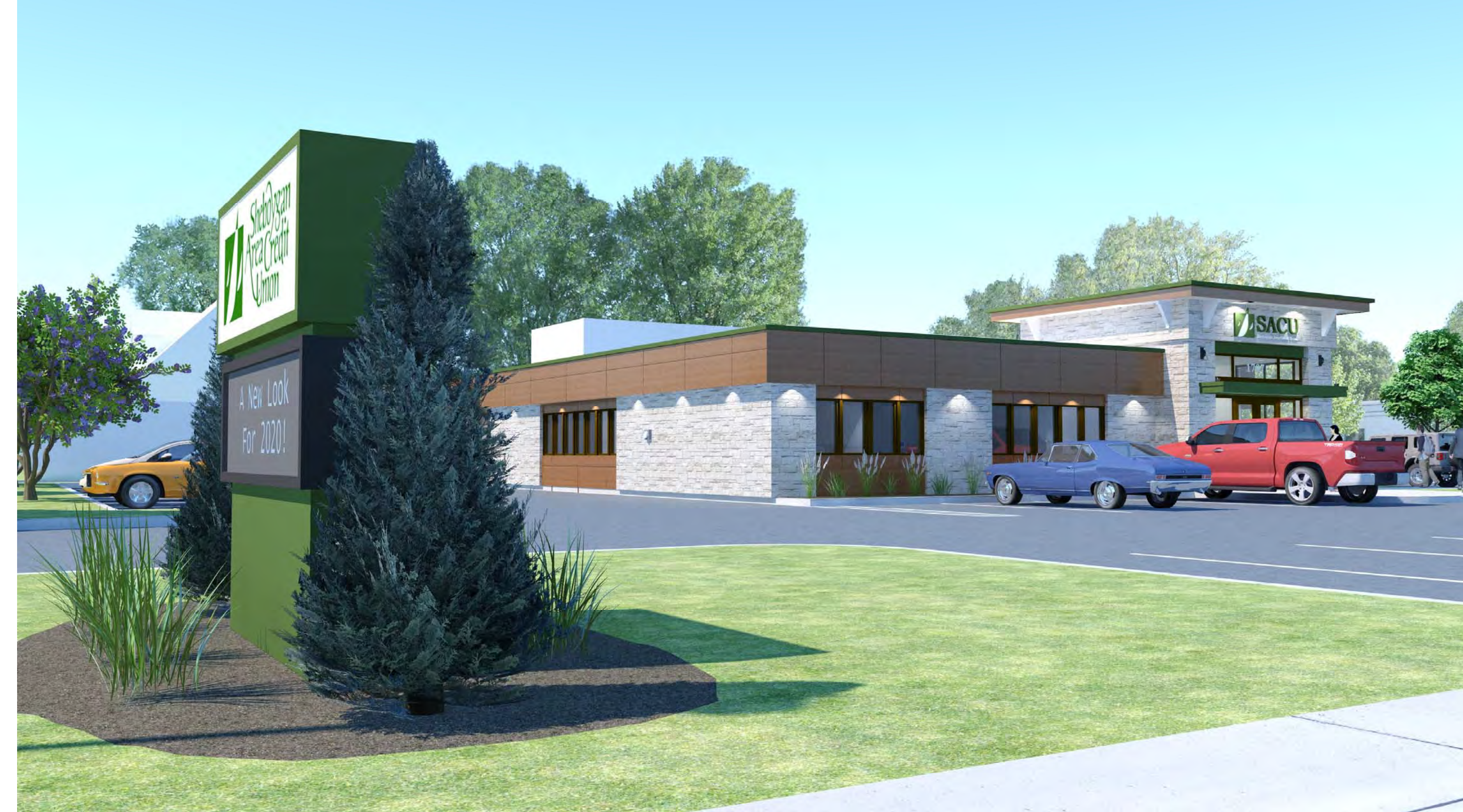
PROPOSED RENOVATION FROM NORTH EAST