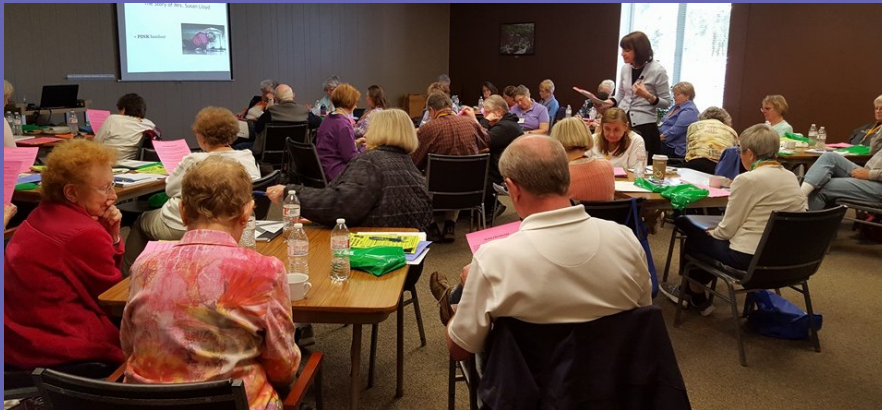
Picked by the National Council on Aging to be one of 13 pilot sites in Wisconsin to teach the Aging Mastery Program, a 10 week series which aims to educate and inspire older adults to take small steps that can have a large impact on their lives.

Encouraging wellness, learning and recreation.