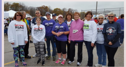
Road America Cancer Walk