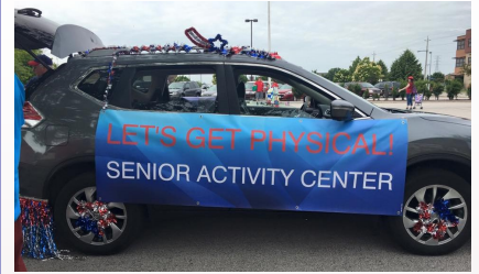
July 4th Parade