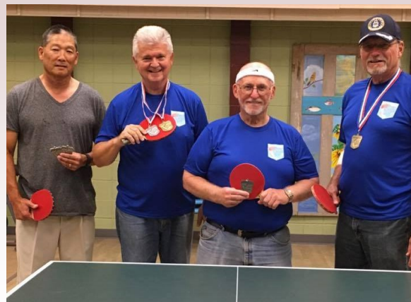
Senior Olympic Medal Winners