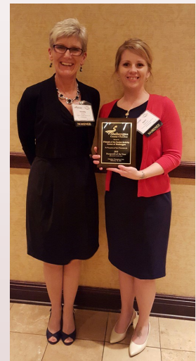
Senior Activity Center nominated for Sheboygan Chamber' of Commerce Non Profit of the Year.