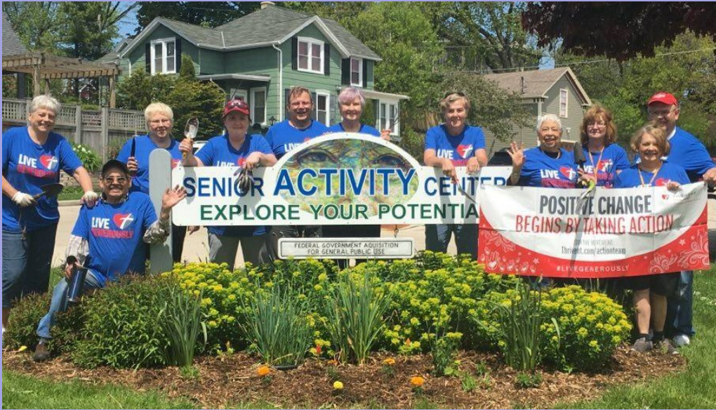
Seniors create Thrivent Action Teams and received $1000 in 2016.

Volunteer Center of Sheboygan County sends local company volunteers to complement our own volunteer efforts.