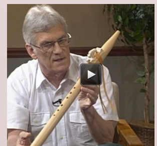
Winner- Best TV Show produced by seniors in "Best of Midwest" competition.