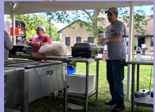
Senior volunteers at Brat Days who work and raise money for the Senior Activity Center.