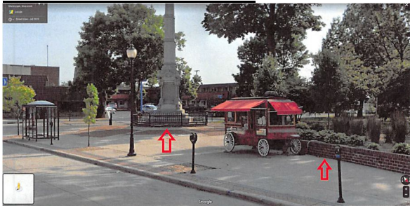
Fountain Park Monument