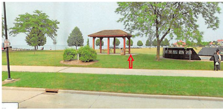
900 Broughton Drive