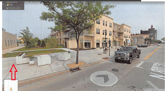
Corner of N. 8 th and Wisconsin Ave.