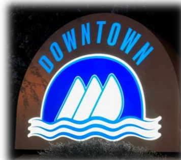
A fresh face on the 8 th Street Island sign showcases the new logo for the Harbor Centre.